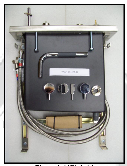
Photo 1. VOLA 14 Thermostatic mixer for bath filling and mixer with hand shower